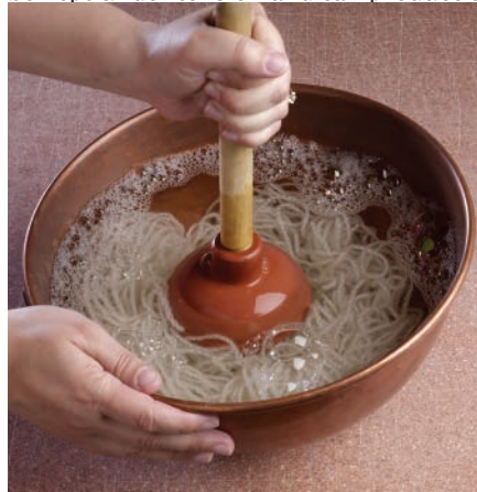
Fulling a skein of Rambouillet in hot, soapy water with a plunger for extra agitation.

Blocking puts a wet skein under pressure while it dries. The amount of pressure can vary from that applied by a damp towel placed on the skein to drying the skein with heavy weights hung from it. You can also use a yarn blocker for drying multiple skeins of yarn under pressure. Blocking is used when the crimp structure is meant to be kept under tension and can produce a