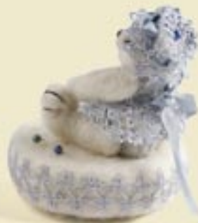
Nita Schwenn Seal Beach, CA Polly by Nita Schwenn. Needle-felted, tatted. Wool fabric, beads, cotton thread, silk ribbon.