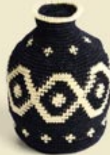
Jing Wu Monmouth Junction, NJ Vase pincushion by Jing Wu. Tapestry-crocheted. Cotton thread.