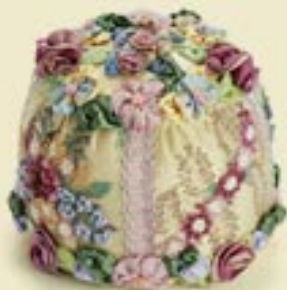
Christen Brown San Diego, CA Silk Petit Four by Christen Brown. Embroidered. Silk ribbons, bias ribbons, picot-edged ribbons; silk, linen, cotton floss; silk thread; silk fabric.