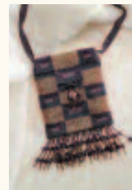
Evening Out by Shelley Hauge Wong. Beaded. From Beadwork Creates Beaded Bags (Interweave Press, 2003). Part of The Beaded Bag , at Bead Expo, Oakland Convention Center, Oakland, California.

Gettysburg, Pennsylvania. September 16–17 and October 21–22. Variations on a Sleeve and Collars, Cuffs and Undersleeves, respectively, workshops at Civil War accessories, at