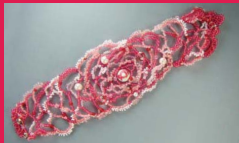
Gail Engle's Strawberry Fizz bracelet